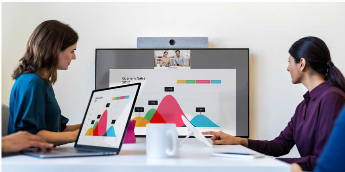
Figure 1. Cisco Webex Room Kit Mini in a small room

The Room Kit Mini is ideal for huddle spaces with three to five people because of its wide 120-degree field of view, which allows everyone in a huddle space to be seen. It also offers the flexibility to connect to laptop-based video conferencing software via USB. The Mini is tightly integrated with the industry-leading Cisco ® Webex platform for continuous workflow, and can register on premises or to Cisco Webex in the cloud.